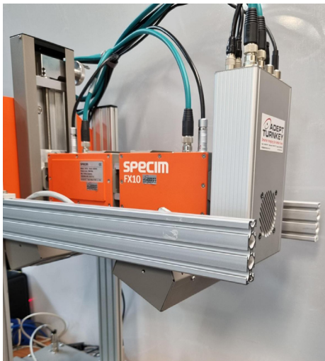
FX Fusion system

Empower your Analysis with Seamless Integration and Precision. Combine the data from two, low-cost, hyperspectral sensors into a single, seamless dataset with pixel correlation.