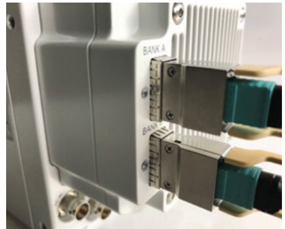
Phantom S991 with cables