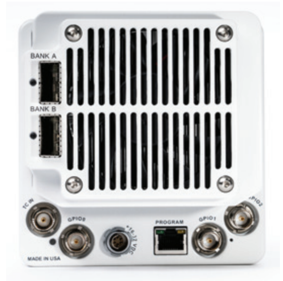
Phantom S991 Connectors