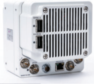
Phantom S991 Back View