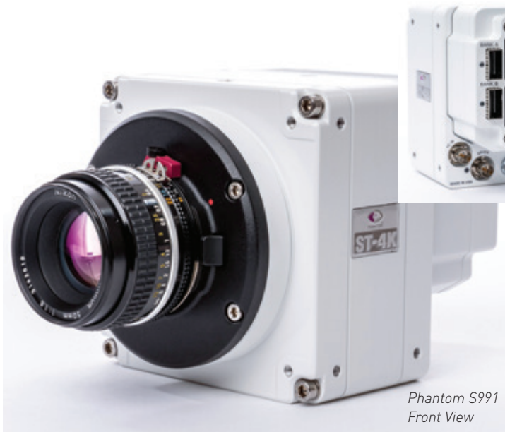
Phantom S991 Front View