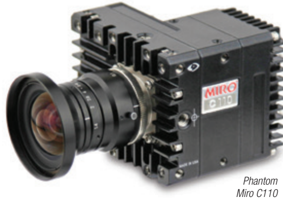
Phantom Miro C110