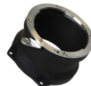
OPTIONAL F-MOUNT ACC-01-5014

*Ranges are the same in binning and no binning modes.