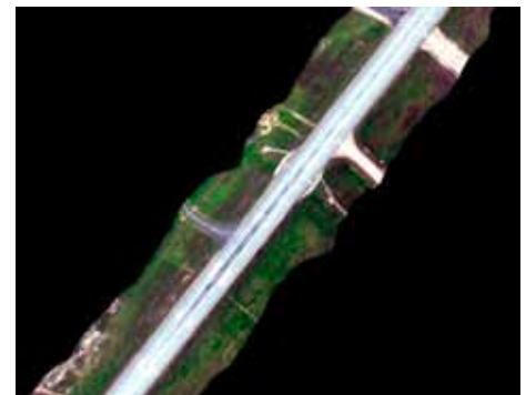
Georectified AisaFENIX image