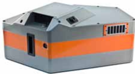
AisaFENIX sensor L: 387 mm W: 222.5 mm H: 450 mm Mass: 15 kg

» -75% REDUCTION IN SIZE AND WEIGHT COMPARED TO PREVIOUS MULTI-SENSOR SYSTEMS «