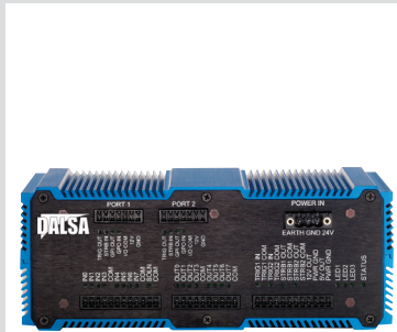
GEVA Vision System