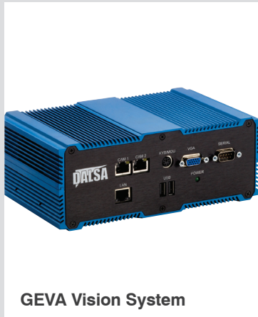
GEVA Vision System

Perth: +61 (08) 9242 5411 Sydney: +61 (02) 9979 2599 Melbourne: +61 (03) 9555 5621 Email: adept@adept.net.au Web: http://www.adept.net.au