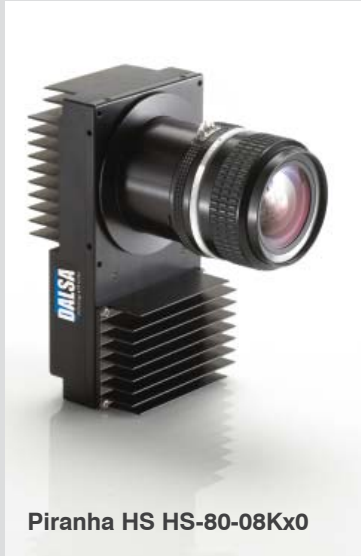
Piranha HS HS-80-08Kx0