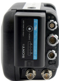
Miro M-Series Rear View shown with optional BP-U60 battery

The M120 is based on a >2Mpx sensor and 1.6 Gpx/s throughput. That translates to 730 fps at 1920 x 1200 , or over 1200 fps at 1152 x 1152 . This camera uses microlenses on its custom-designed CMOS sensor with 10 µm pixel pitch to achieve high light sensitivity. With 12-bit pixel depth, it also sports high dynamic range for excellent image quality. Maximum frame rate at reduced resolution is 400,000 fps.