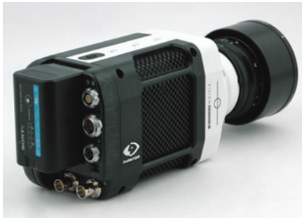
Miro M120 shown with optional BP-U60 battery