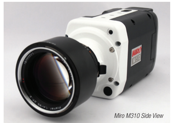
Miro M310 Side View

Each camera model comes in three memory configurations: 3 Gigabytes (GB), 6 GB or 12 GB. The high-speed internal memory can be segmented into as many as 16 partitions for cine storage. (A cine is Vision Research's raw image format that stores all image data in a compact file.)