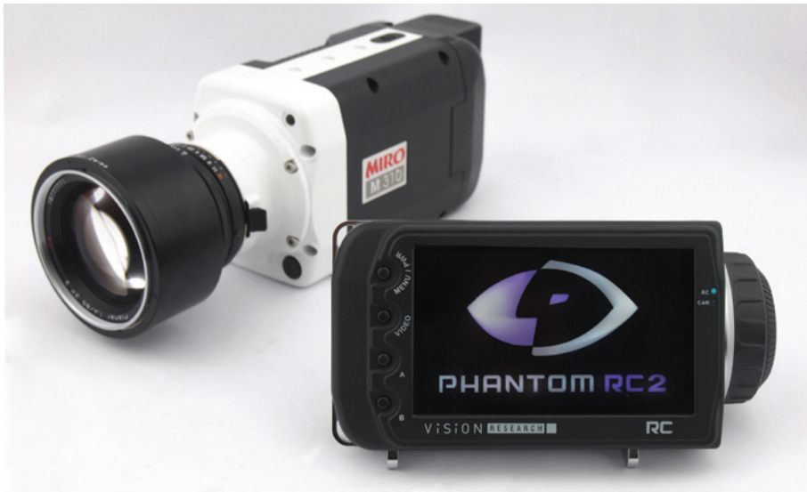
Miro M310 shown with optional Remote Control Unit (RCU)

For the most current version visit www.visionresearch.com Subject to change Rev Nov 2011