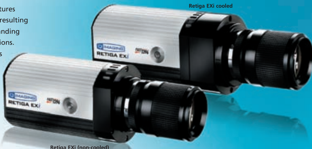
Retiga EXi (non-cooled)

The QImaging Retiga EXi digital camera features enhanced visible and IR quantum efficiency resulting in very high sensitivity that is ideal for demanding low-light and fluorescence imaging applications. A progressive-scan interline CCD sensor gives a resolution of 1.4 million pixels in a 12-bit digital output. High-speed, low-noise electronics provide linear digital data for rapid image capture. The IEEE 1394 FireWire™ digital interface allows ease of use and installation with a single wire. No framegrabber or external power supply is required. The Retiga EXi includes QCapture software (Windows® and Mac OS) for real-time image preview and capture. A Software Development Kit (SDK) is available for interfacing with custom software.