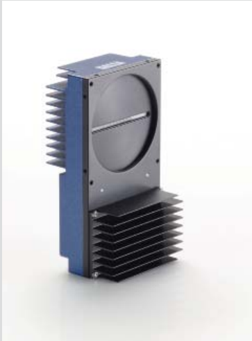
Piranha ES ES-80-08Kx0