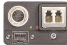
Copper / GOF connections