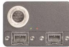
Copper / Daisy Chain